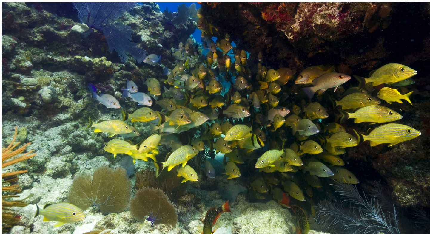
Fish and corals in Florida's coastal waters