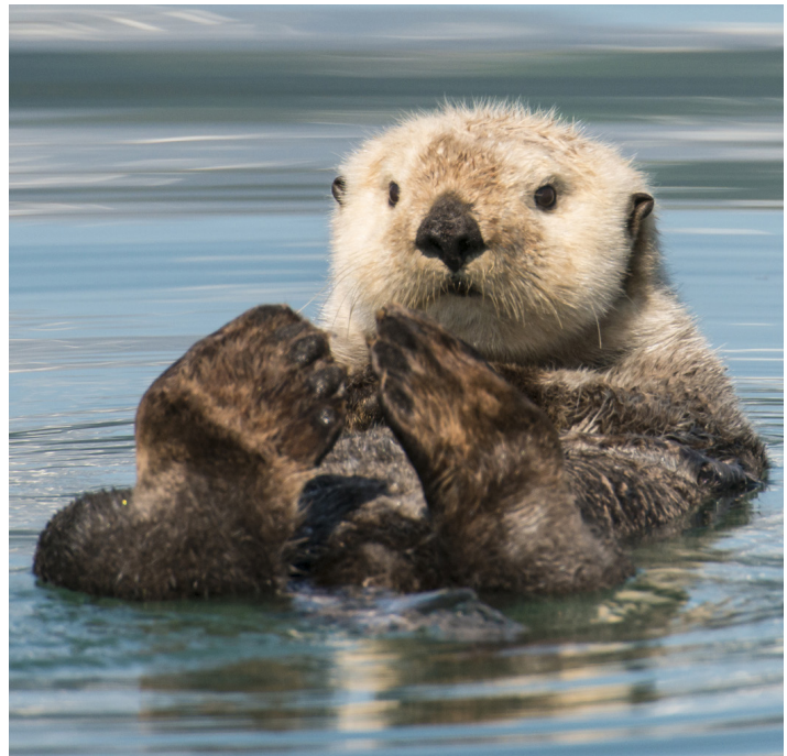
Sea otter in coastal Alaska

Develop a publicly informed and community-supported design to restore and strengthen Marin City’s urban wetland. Project will improve the functionality and resilience of wetland habitat that will serve as shoreline protection from storms and floods while supporting birds and other wildlife, and providing much-needed opportunities for local residents to engage with nature.