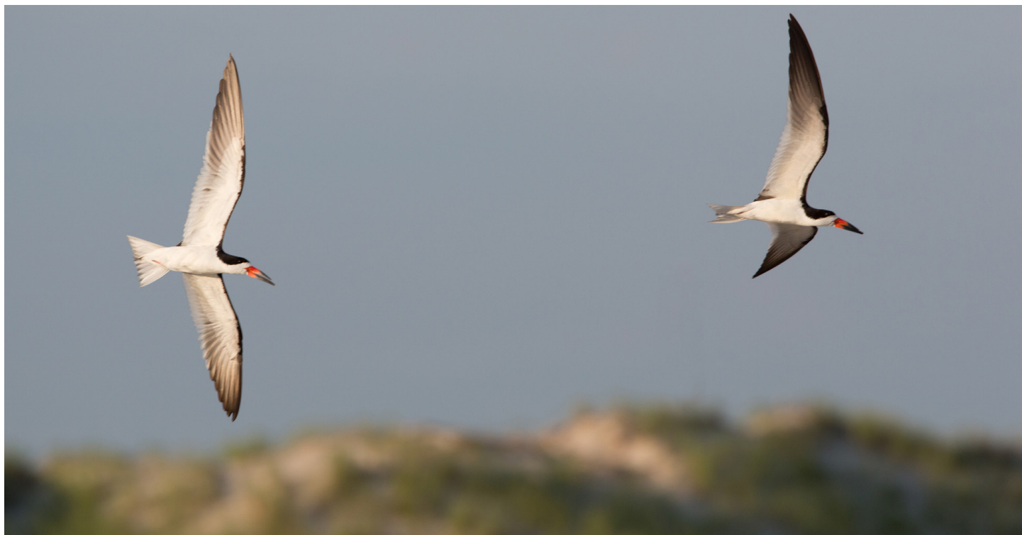
Black skimmers flying over dunes in coastal New York