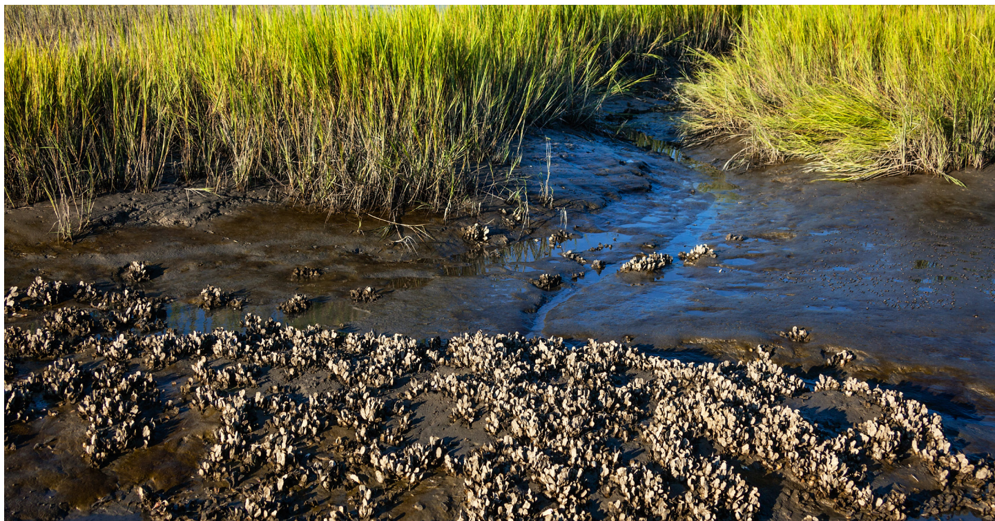
Oysters at low tide in a salt marsh