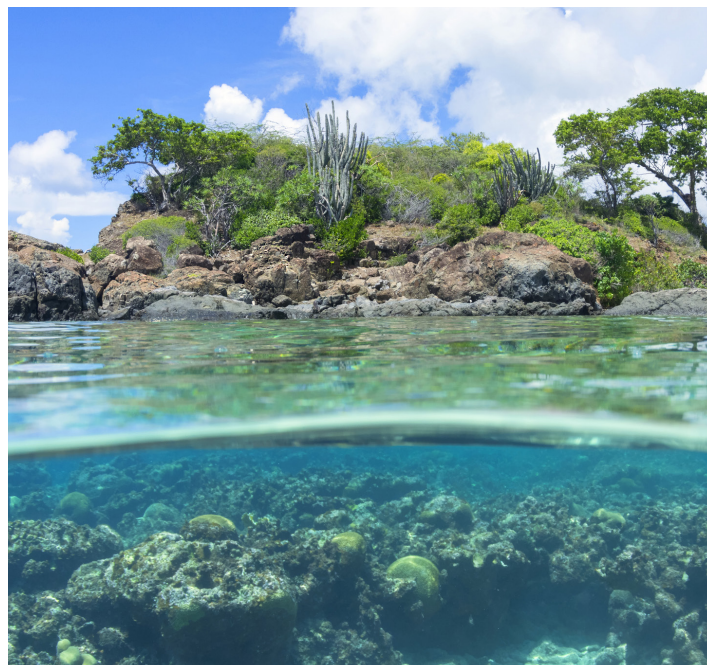
Corals in coastal Puerto Rico

Restore the three-dimensional structure across coral reefs that were severely damaged by Hurricanes Irma and Maria. Project will use a multi-method restoration approach that combines the out-planting of artificial coral colonies created with emerging 3D printing technology with multispecies out-plants composed of morphologically complex branching and massive corals.