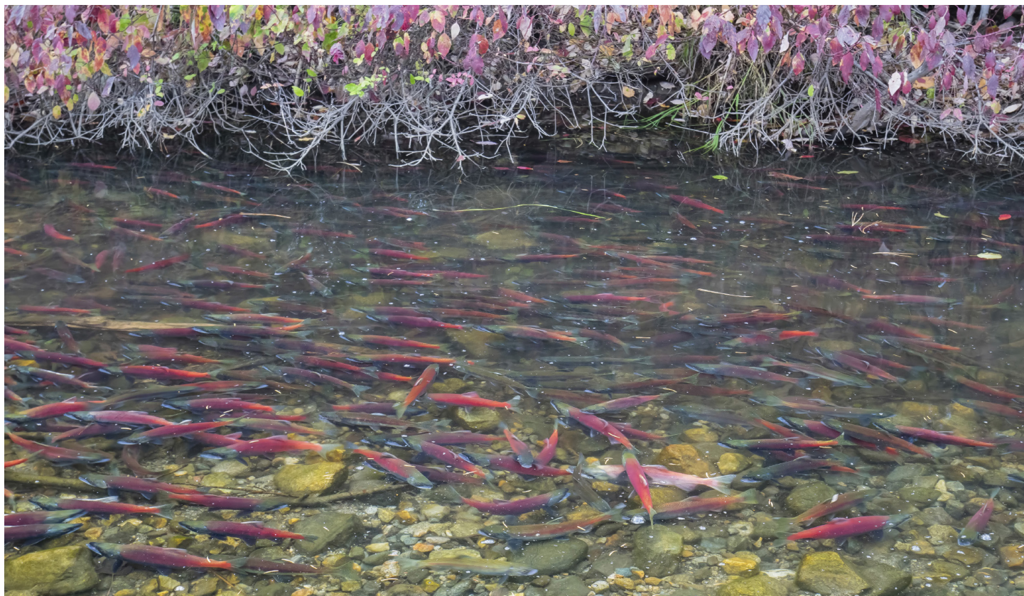
Sockeye salmon during migration

residences; and improve recreation opportunities.