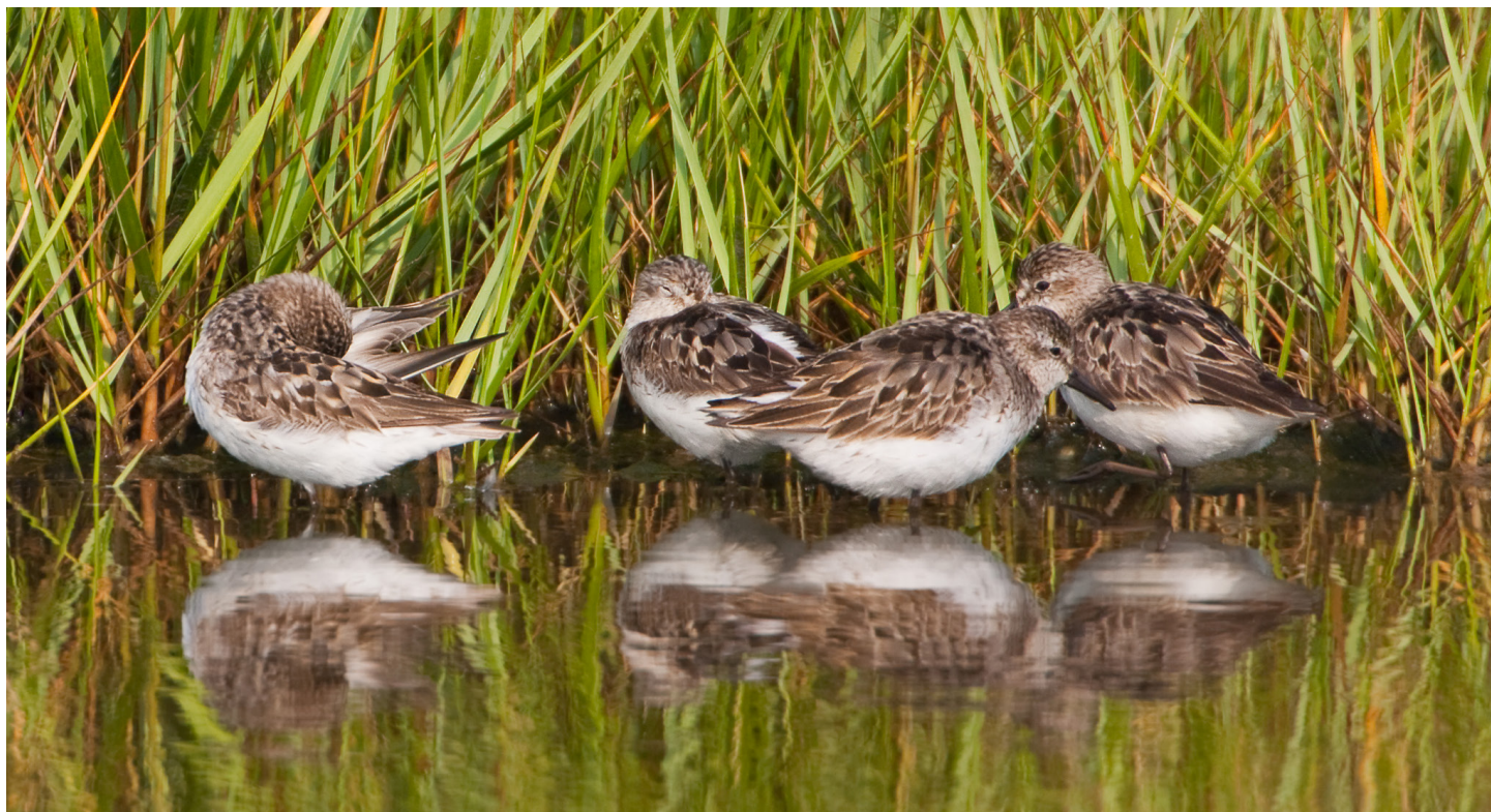
Semipalmated sandpipers resting in a salt marsh in Massachusetts